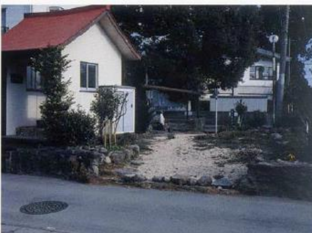
Remains of tower