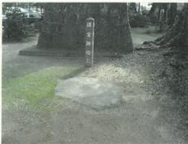
Foundation stones of lecture hall

*Chikuzen and Chikugo are two of three provinces that consist of Fukuoka Prefecture.