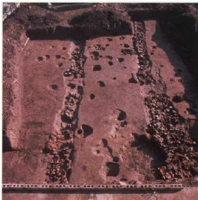
Remains of roofed mud walls