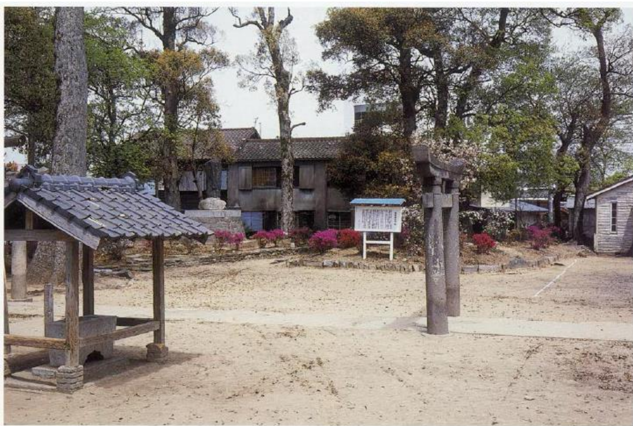
The remains exist in the precincts of the Kokubumachi-Hiyoshi Shrine.