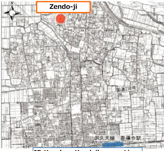
JR Kyushu –Kyudaihonsen Line Zendo-ji Station

It is located on the north side of the large living quarter and measures 11.9 meters by 8.0 meters. There is a large cook stove with three holes at the top to put pots ( kama ), an earthen floor, and a board floor. It is a rare case that a kitchen is independently built, because the cook stove is usually placed in the living quarter. As a result of excavation and research before the renovation, it was unveiled that a large stove used to be in the former living quarter before the fire in 1748 and that when they rebuilt it, they separately built a kitchen.