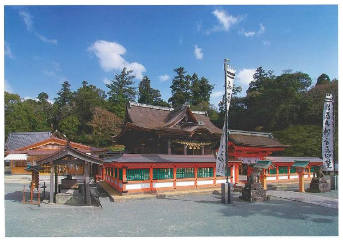
The Kora-taisha Shrine

*For further details about kogoishi, refer to Kurume History Walks, No. 20 Korasan Kogoishi.