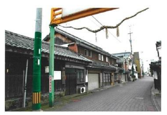
A street with buildings of the 20th Century

Tanushimaru Town was changed as much as the others today. However, some structures between the 17th and 20th century remain such as the form of roads, the Hibarigawa Ditch, narrow paths, a sake cave of Wakatakeya Brewery, which appears on the map (in Figure 2 on the opposite bank of the Kamaeguchi ), some Western-style building of the early 20th century, some other old building and so on.