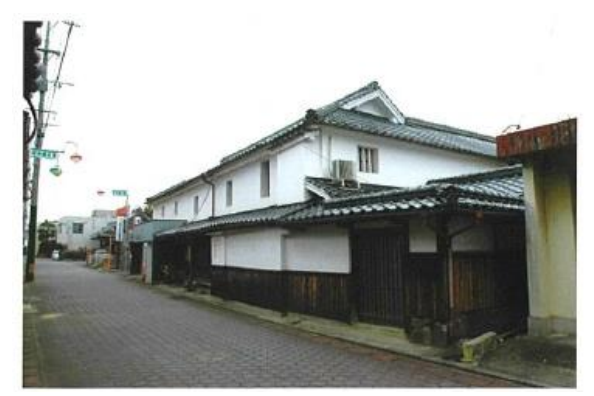
A street with buildings of the Edo period