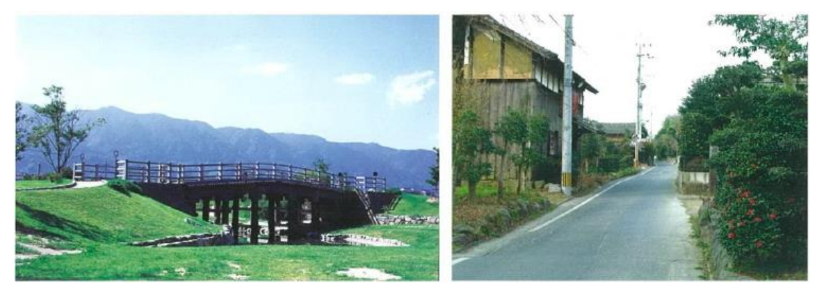
Ishiura Ohashi Bridge

Besides, there are several places with the atmosphere of that time on Nakamichi Okan Street in other towns of Kurume.