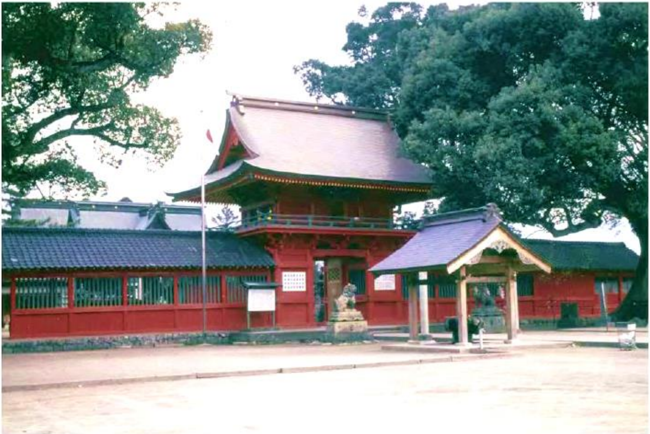
Main Gate of Kitano Tenman-gu Shrine ① *Figure in a circle indicates that of the map on the fourth page.

*Kitano Town, which had been an independent municipality, merged with Kurume City in 2005.