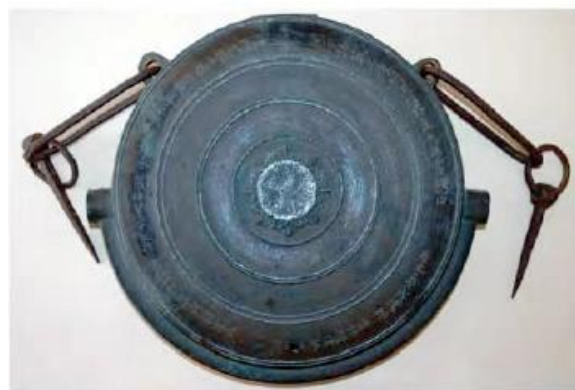
Bronze gong ⑧