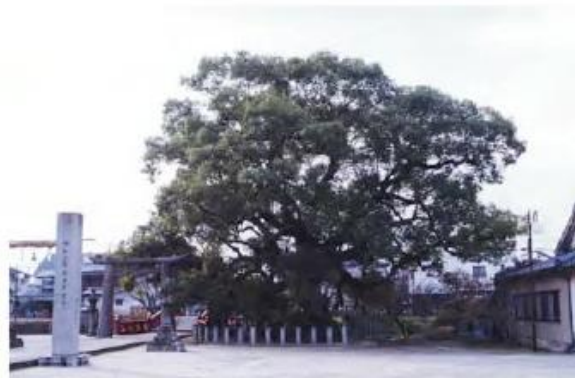
Camphor Tree ⑥