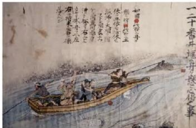
Illustrated history of the Tokoshima Irrigation Channel ⑪

Besides, there are three municipal cultural properties in the town.