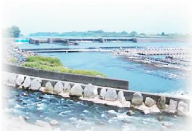
Tokoshima Irrigation Channel ②