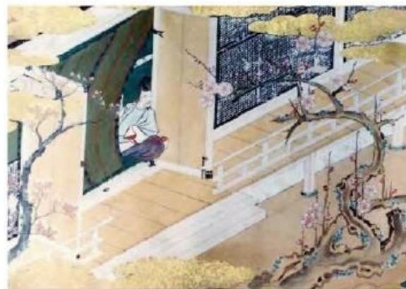
Illustrated Legends of Kitano Tenman-gu Shrine in Chikugo Province ⑦

- Jinko Festival is held on the third Sunday of October.