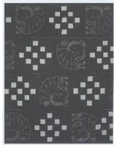
ふとん絣「市松 お多福と扇」 (大正初期)