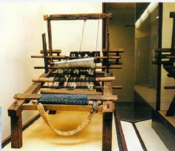
● Kurume Kasuri Sitting Loom (Prefectural Tangible Folk Cultural Property)