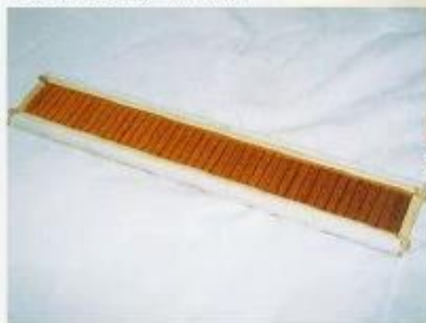
● Reed: a tool for calculating the needed number of the yarns for expressing a pattern