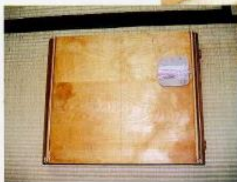
● Board for making the weft marker