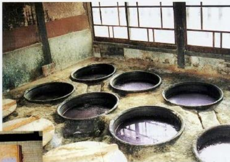
● Indigo dye in half-buried pots