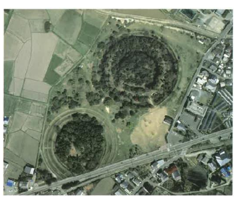
The Ontsuka (lower left) and Gongentsuka (upper right) Kofun

In this book, he also wrote about Ontsuka and Gongenzuka Kofun and the survey value by the field research. He depicted those mostly as those are today. And his measured value was very close to the result of our investigation.