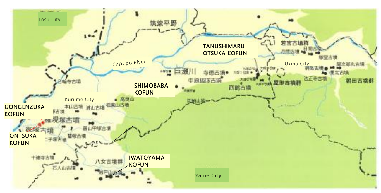
Major kofuns along the Chikugo River

By the way, in the late 5th century, Chikushi no Kimi clan had the biggest power in the northern Kyushu. They had a significant influence on the kofun culture of this province. The clan prospered in the generation of